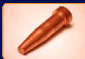
High Speed Cutting Nozzle